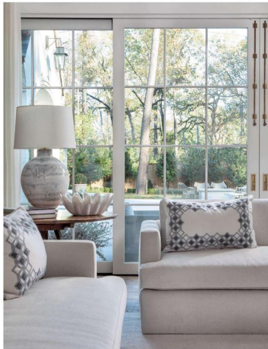
The living room's custom Belgian-style sofas in Holly Hunt fabric are accented with pillows in a Holland & Sherry custom embroidered material. Interior designer Sheri Bailey chose a hand-blown lamp with a marble finish from Longoria Collection to top an antique walnut table from Lir Spradling Antiques.

These interiors flow seamlessly outside thanks to a combination of archways, reclaimed beams and wall-mounted gas lanterns. And Newberry devised multiple poolside “destinations” for the family to use both together and with guests. “It’s what I looked forward to having most,” says Bailey, noting the men often retreat to the limestone-top fire pit, while the ladies gather with wine and cheese on sofas near the loggia fireplace. “In the warmer months we’ve dined outdoors almost every night,” she adds. All the while, landscape designer Serena Gibson helped imagine a landscape that “didn’t look too manicured,” Bailey says. Hence, wisteria cascades over a pergola in the grill and bar area, Boston Ivy climbs the mortared brick and clusters of Peggy Martin roses burst with pink blooms on a gable wall over the loggia—creating a tranquil scene hearkening back to the English gardens of Bailey’s childhood. “Every Saturday morning you’ll find me outside reading my design books,” she says. “I love the sense of comfort and calmness this home provides.” ■