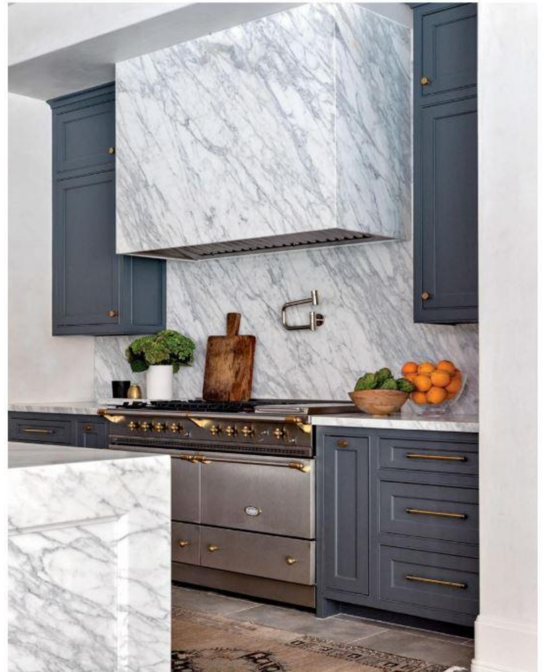
Above: The kitchen's Calacatta marble vent hood and backsplash from Walker Zanger frame a Lacanche gas range. The rug is from Carol Piper Rugs.