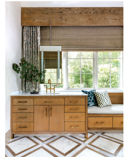
INSIDE THE PRIMARY BATHROOM, THE VANITY'S NATURAL WOOD TONES ARE TOPPED WITH SLABS OF WHITE MARBLE AND ACCENTUATED WITH THE WHITE-AND-GOLD-TILED FLOOR.

The altar is flanked by white custom cabinets with glass panels and brass finishes on either side to complete a sense of flow and cohesion. Another dazzling antique find is the hardwood flooring throughout the kitchen, with the few leftover panels repurposed in the upstairs wet bar, while several other varieties and shades of vintage wood grace the home to deliver bespoke, artisanal details.