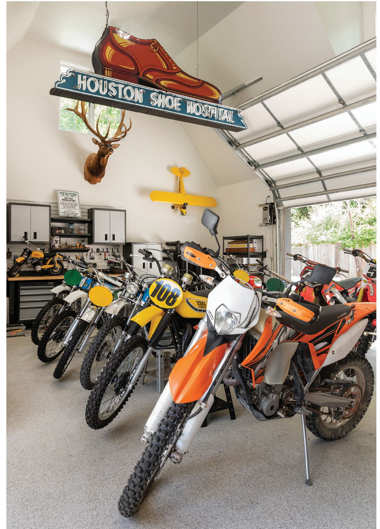
AS AN AVID HUNTER AND MOTORCYCLE ENTHUSIAST, THE HUSBAND REQUESTED A DEDICATED SPACE WITHIN THE GARAGE TO SERVE AS HIS MAN-CAVE.