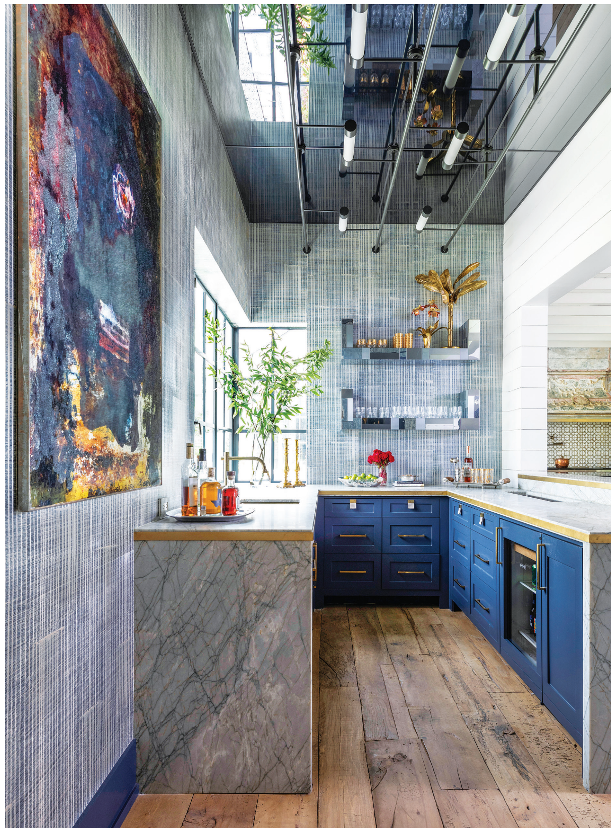
THE HOMEOWNERS LOVINGLY REFER TO THIS ALCOVE AS THE WHISKEY BAR, STOCKED AND PREPPED FOR GUESTS AND/OR A BASH, FEATURING A TOWERING WINE UNIT AND CRATES OF WHISKEY HIDDEN AWAY IN THE DRAWERS. A CUSTOM, RECTANGULAR ICE BUCKET IS CUT INTO THE COUNTERTOP TO KEEP BOTTLES OF CHAMPAGNE CHILLED AND READY TO IMBIBE, WHILE THE LIGHT FIXTURE WAS CUSTOM BUILT BASED ON A PHOTOGRAPH THE CLIENT FOUND OF AN OLD BAUHAUS PROJECT.