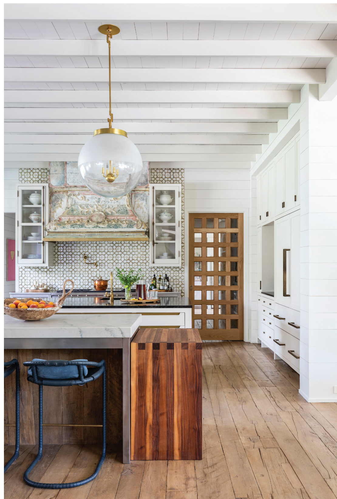
THIS KITCHEN HAS A DASH OF EVERYTHING: VINTAGE FINDS, LUXE MATERIALS, CUSTOM MILLWORK AND PLENTY OF UPCYCLED WOOD WITH GRAINS THAT TELL A STORY.